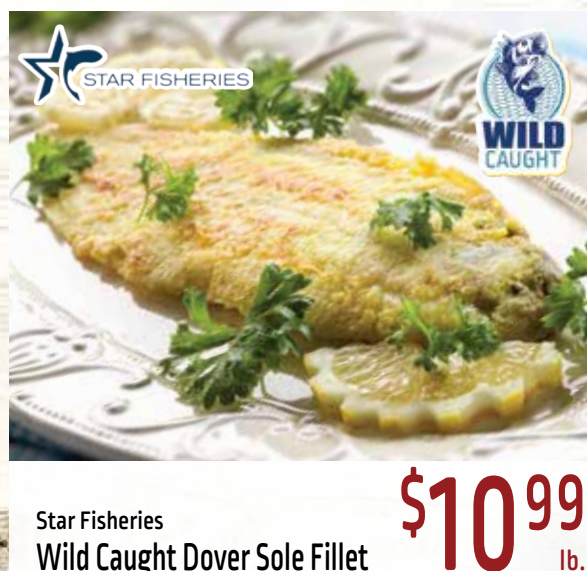
Star Fisheries Wild Caught Dover Sole Fillet $10 99 lb.