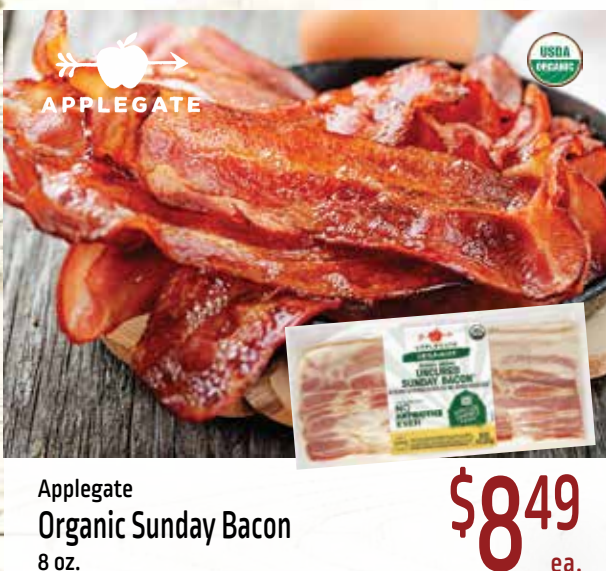
Applegate Organic Sunday Bacon 8 oz. $8 49 ea.