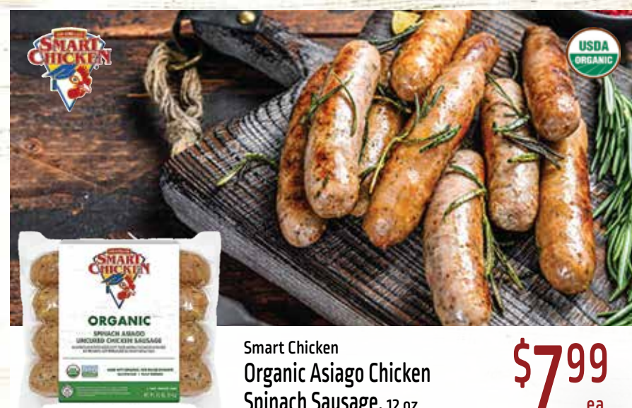
Smart Chicken Organic Asiago Chicken Spinach Sausage, 12 oz. $7 99 ea.