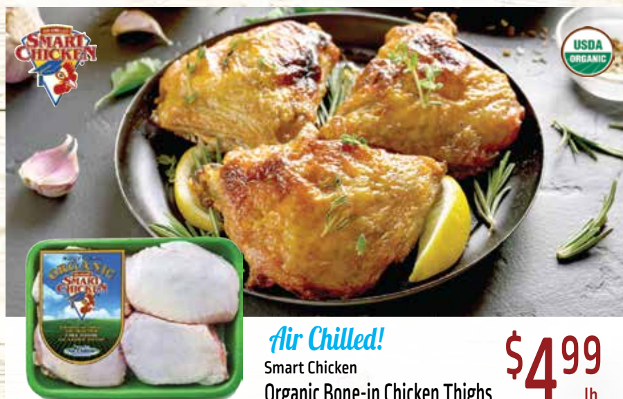
Air Chilled! Smart Chicken Organic Bone-in Chicken Thighs $4 99 lb.