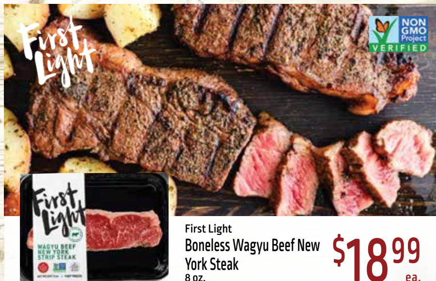
First Light Boneless Wagyu Beef New York Steak 8 oz. $18 99 ea.