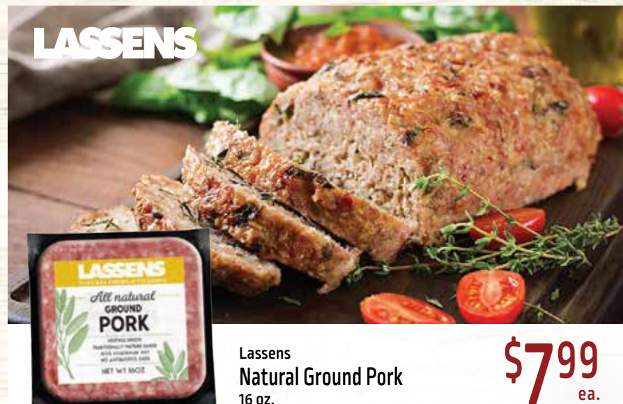
Lassens Natural Ground Pork 16 oz. $7 99 ea.