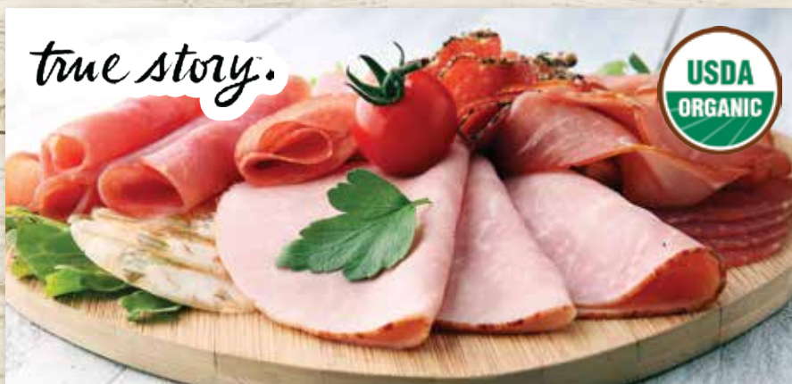
True Story Deli Meats Line 6 oz.

Smoked Turkey Breast, Oven roasted Turkey Breast, Thick Cut Chicken Breast, Uncured Black Forest Ham, Uncured Applewood Smoked Ham