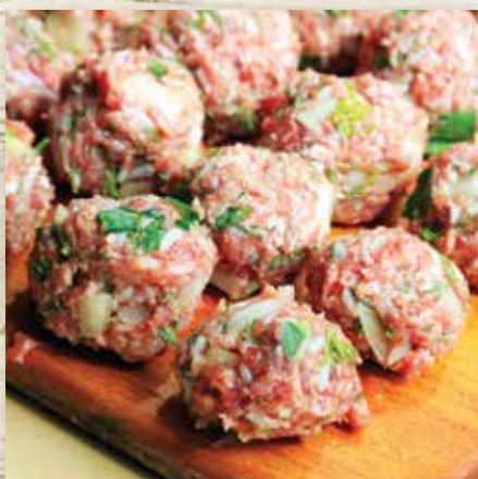
Diestel Ground Turkey 94% Lean, 6% Fat, 16 oz.