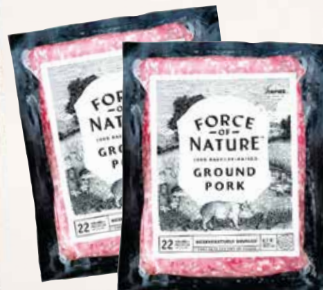
Force of Nature Ground Pork Pasture-Raised 16 oz.