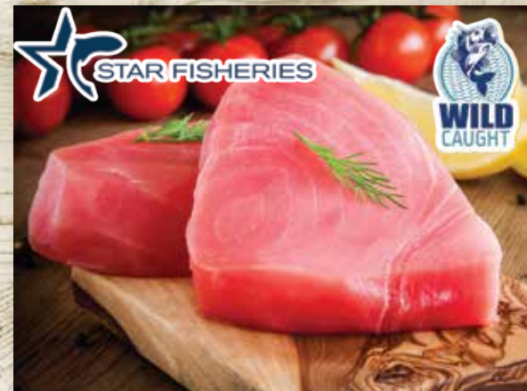
Star Fisheries Star Ahi Tuna Previously Frozen