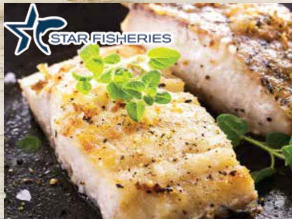
Star Fisheries Star Sword Fish Loin Previously Frozen