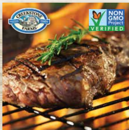
Creekstone New York Steak Boneless, Non-GMO