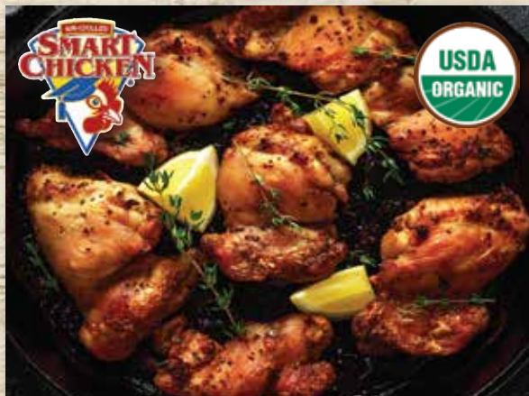
Smart Chicken Boneless, Skinless Chicken Thighs