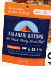
Air-Dried Beef, Original, 2 oz

Grab a bag (or 2!) for your next adventure and never waste a single bite of life!